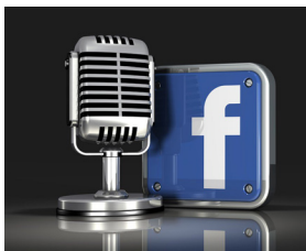
Facebook LIVE Outline

Now write your E-book from this outline.